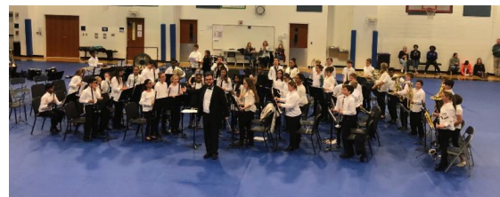
6th Grade Band