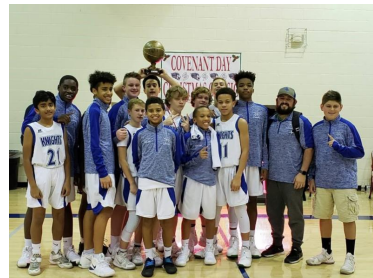
MS boys' basketball team

Click here to see a schedule of all upcoming Athletic events.