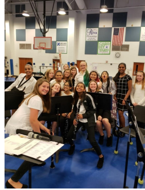
7th Grade Band