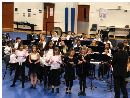
5th Grade Band