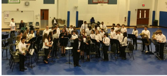
8th Grade Band