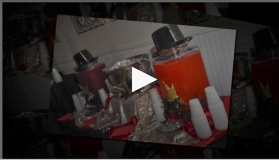
LNCS Father & Daughter 2019