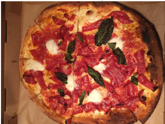
Pictured: Sorrento pizza

Location: Concord Mills Mall, near Sun and Ski