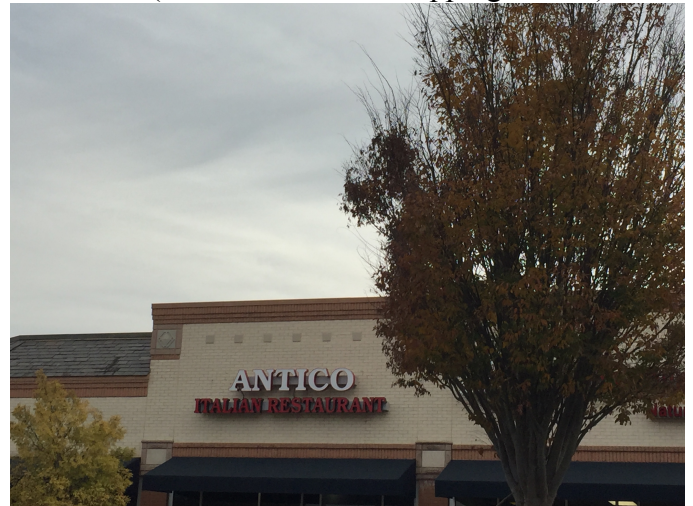
Pictured: Front of Antico Italian Restaurant

Location: 9719 Sam Furr Rd Unit C Huntersville NC 28078 (Near the Lowe's Shopping Center)